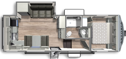
ASTORIA HALF TON FW 230ML Length: 27' 11" Weight: 7,285 lbs Sleeps: 2-3