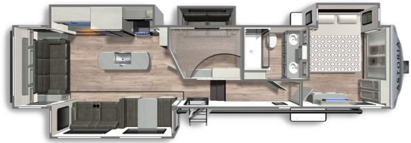
ASTORIA PLATINUM FW 3553MBP Length: 39' 11" Weight: 11,551 lbs Sleeps: 8-10