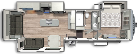
ASTORIA PLATINUM FW 3173RLP Length: 35' 11" Weight: 10,016 lbs Sleeps: 3-4