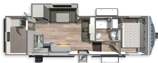
ASTORIA HALF TON FW 280BH Length: 32' 11" Weight: TBD Sleeps: 6-8