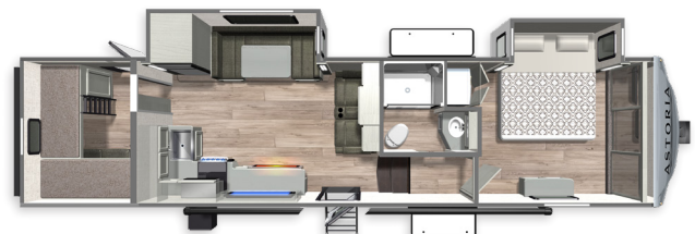
ASTORIA HALF TON FW 320BH Length: 36' 10" Weight: TBD Sleeps: 6-8