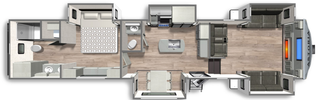
ASTORIA PLATINUM FW 3803FLP Length: 42' 5" Weight: 11,957 lbs Sleeps: 6-8