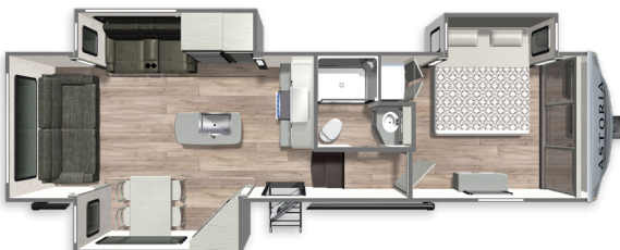
ASTORIA HALF TON FW 300RL Length: 34' 10" Weight: TBD Sleeps: 3-4