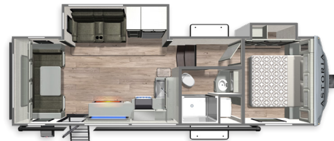
ASTORIA HALF TON FW 250RD Length: 29' 11" Weight: 7,870 lbs Sleeps: 2-3