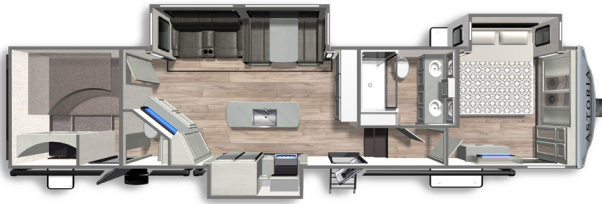
ASTORIA PLATINUM FW 3603LFP Length: 40' 9" Weight: 11,510 lbs Sleeps: 6-8