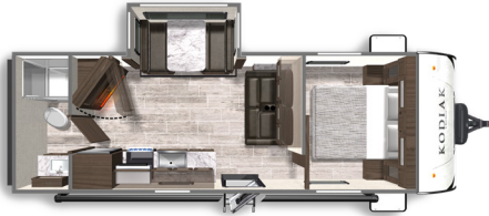
242RBSL - Length: 28' 10" Weight: 5,137 lbs Fresh Water: 44 gals. Grey Water: 39 gals. Waste Water: 28 gals.