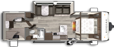
280BHS - Length: 32' 10" Weight: 5,519 lbs Fresh Water: 44 gals. Grey Water: 39 gals. Waste Water: 28 gals.