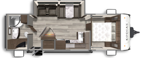
260RBSL - Length: 30' 10" Weight: 5,447 lbs Fresh Water: 44 gals. Grey Water: 78 gals. Waste Water: 28 gals.