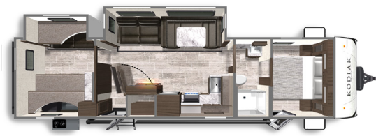
332BHS - Length: 37' 3" Weight: 7,157 lbs Fresh Water: 44 gals. Grey Water: 78 gals. Waste Water: 28 gals.