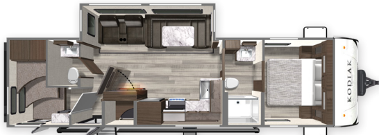
302BHS - Length: 34' 11" Weight: 6,628 lbs Fresh Water: 44 gals. Grey Water: 78 gals. Waste Water: 56 gals.