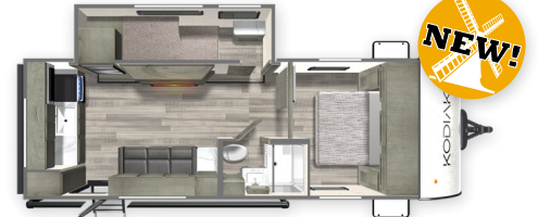
241BHS - Length: 28' 11" Weight: 5,090 lbs Fresh Water: 44 gals. Grey Water: 39 gals. Waste Water: 28 gals.