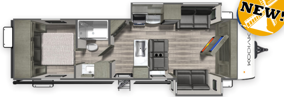
310FLSL - Length: 35' 9" Weight: 6,910 lbs Fresh Water: 44 gals. Grey Water: 78 gals. Waste Water: 28 gals.