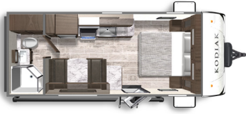
201QB - Length: 24' 1" Weight: 4,193 lbs Fresh Water: 44 gals. Grey Water: 39 gals. Waste Water: 28 gals.