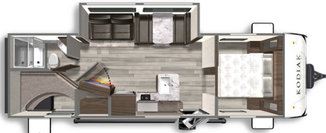
270BHS - Length: 31' 10" Weight: 5,336 lbs Fresh Water: 44 gals. Grey Water: 78 gals. Waste Water: 28 gals.