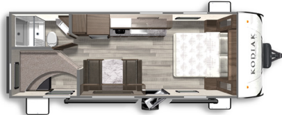
220BHS - Length: 26' 11" Weight: 4,157 lbs Fresh Water: 44 gals. Grey Water: 39 gals. Waste Water: 28 gals.