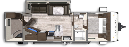
296BHS - Length: 33' 11" Weight: 6,070 lbs Fresh Water: 44 gals. Grey Water: 78 gals. Waste Water: 28 gals.